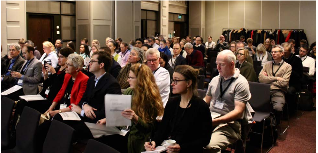
SRA 2016 Nordic Annual Meeting, Gothenburg, Sweden.