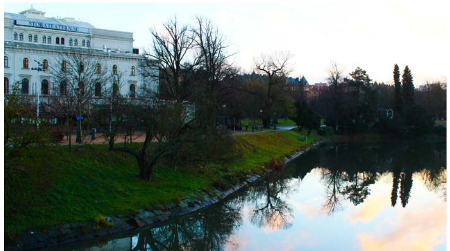
Sunset in Gothenburg, Sweden.

View all photos from the meeting on the SRA Flickr account: https://www.flickr.com/photos/society_for_risk_analysis