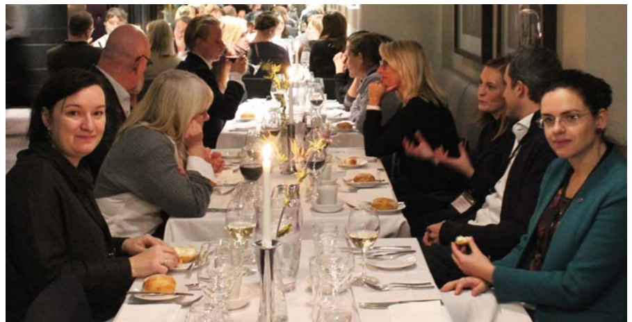
Dinner in the Clarendon Post Hotel.